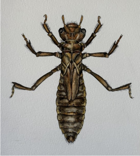
Figure 1: The final instar larva of Uropetala chiltoni drawn by Karen Mason for MJW.