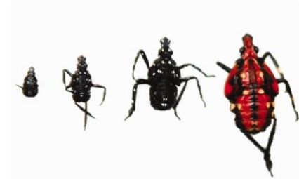
Figure 1. L. delicatula nymphal instars. The first three instars (left to right) are black with white spots. The fourth instar develops red patterning on the dorsal side, covering the head, thorax, and abdomen. Spotting becomes white to yellowish. Photo Credit: Lawrence Barringer (Dara et al. 2015).