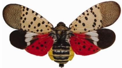
Figure 2. Dorsal view of an adult female L. delicatula . (Dara et al. 2015)

Lycorma delicatula develops through four nymphal instars (Fig. 1) over approximately three months (Dara et al. 2015). Observations have shown that the broadest host range is in the early first to third instars, feeding on fleshy herbaceous plants, whereas fourth instar nymphs narrow their host range and primarily feed on woody plant tissues (Mason et al. 2020). Nymphs and adults feed on phloem tissues using their piercing and sucking mouthparts, and during population booms, can cause extensive damage, resulting in the wilting and death of the host (Ding et al. 2006). As L. delicatula feeds, large amounts of honeydew are excreted, promoting a build-up of sooty mould on the vegetation below, inhibiting photosynthesis and reducing plant growth, and in extreme cases, thick mats of fungal growth accumulate around the host plants base (Teddars and Smith 1976). Volatile chemicals found in honeydew attract large numbers of Hymenoptera and other insects. In L. delicatula 's native range, these chemicals attract notable species such as egg parasitoid Anastatus